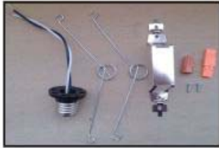
6" Accessory Kit

Order separately to easily adapt the LMC series to 6" white cans. Save over 75% energy from incandescent equivalent fixtures and lasts 40 times longer.