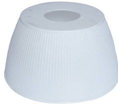
Faux Alabaster Dome (AL)