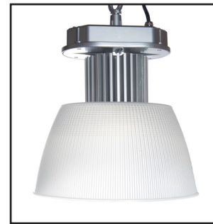
Shown with Frosted Acrylic Lens, add "FR"