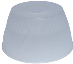
Frosted Dome (FR)