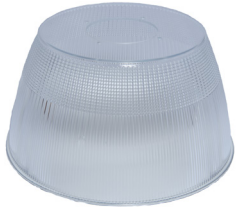
Clear Dome (CL)